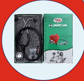
REGULAR MRP:- 599/-