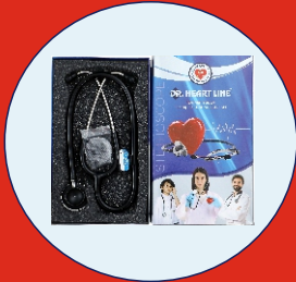
FEATHER TOUCH MRP:- 1599/-