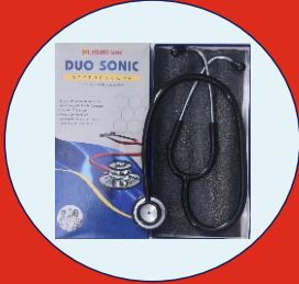
DUO SONIC MRP:- 499/-