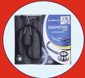
PAEDITRIC AL MRP:- 799/-