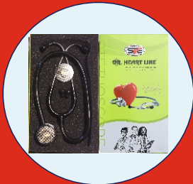
PREMIUM MRP:- 1299/-