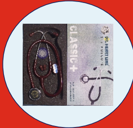
CLASSIC PLUS MRP:- 1799/-