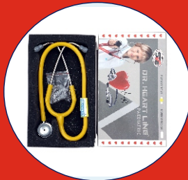
PAEDITRIC AN MRP:- 1599/-