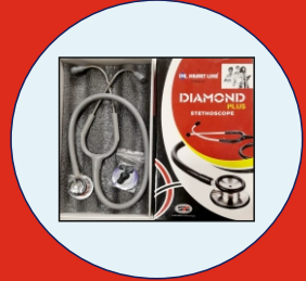
DIAMOND PLUS MRP:- 899/-