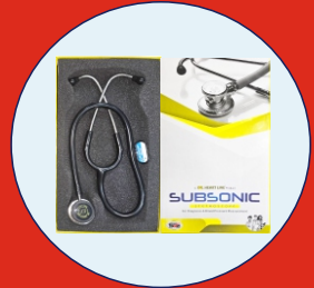
SUBSONIC MRP:- 2699/-